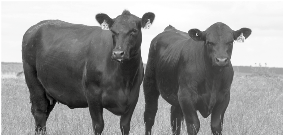
Weeran Herdbook E7 dam with a Musgrave Big Sky bull calf at foot, aged 8 months

Finishing on a high ... Ideal growth curve, with 1% scrotal and top 15% milk. Scanned very well for a September drop calf, measuring 90 sq cm.