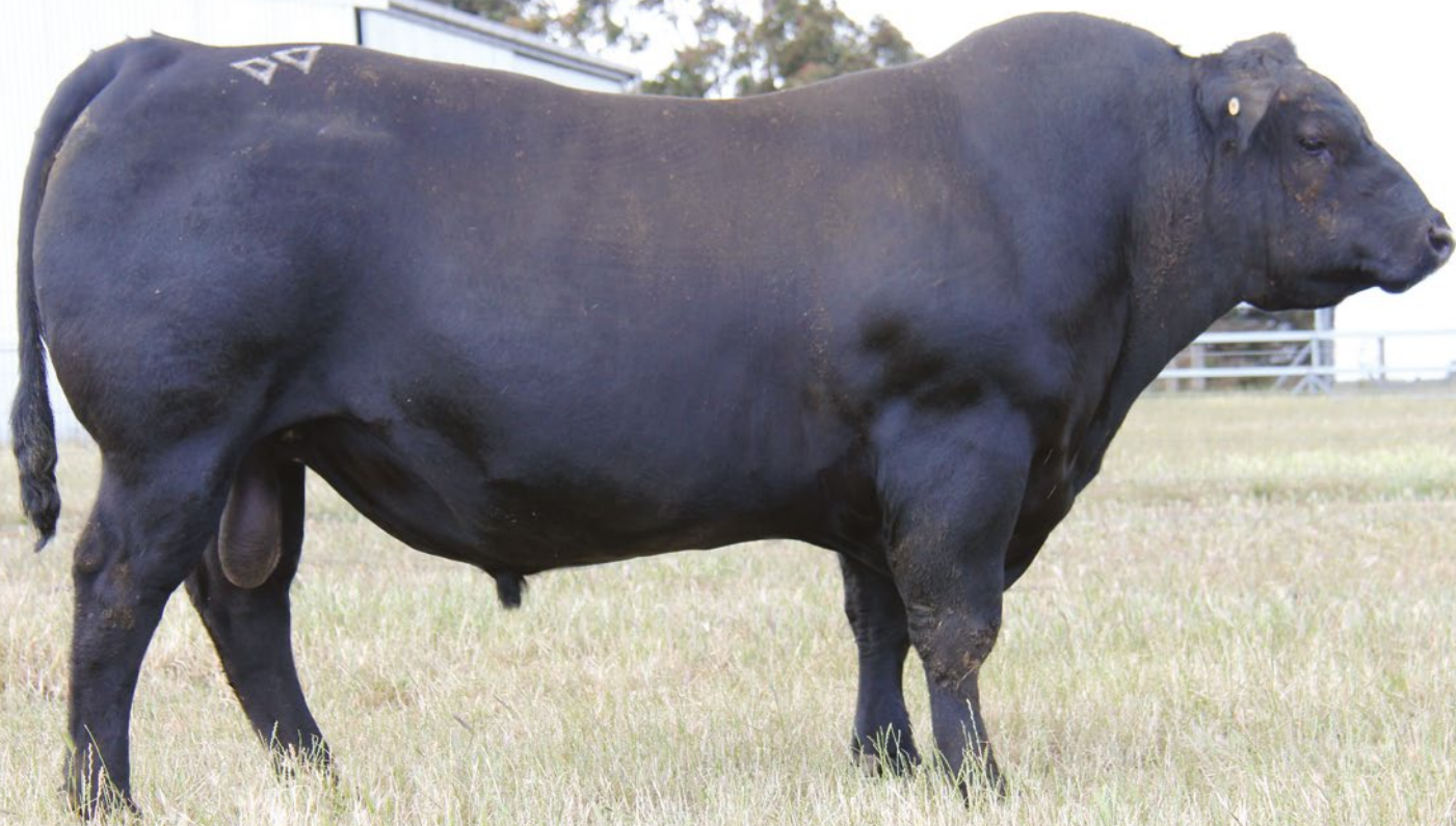
Weeran Hooper H20