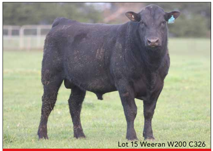
Lot 15 Weeran W200 C326