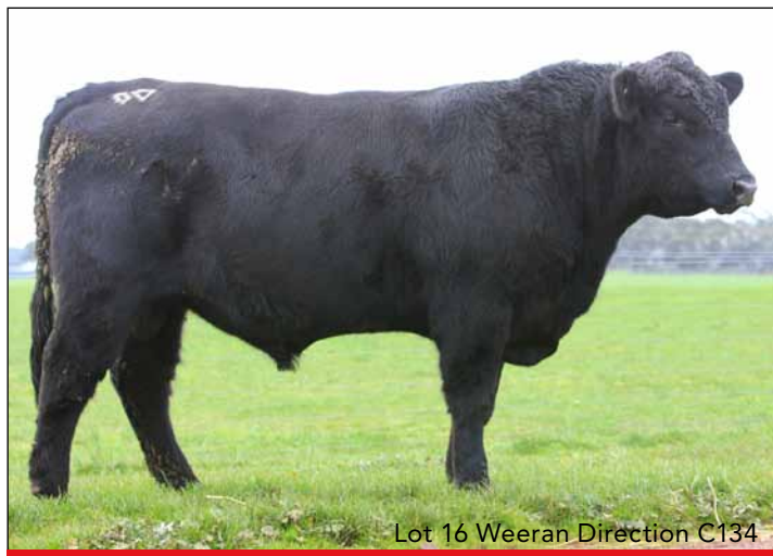
Lot 16 Weeran Direction C134