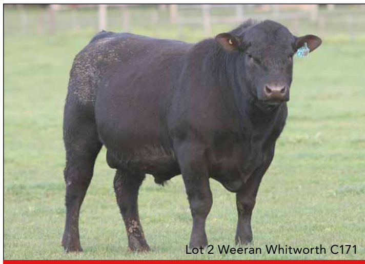
Lot 2 Weeran Whitworth C171