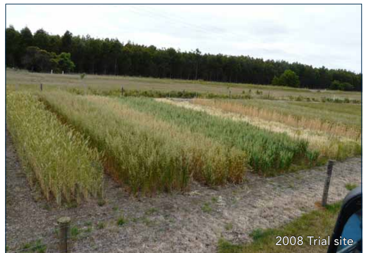
2008 Trial site