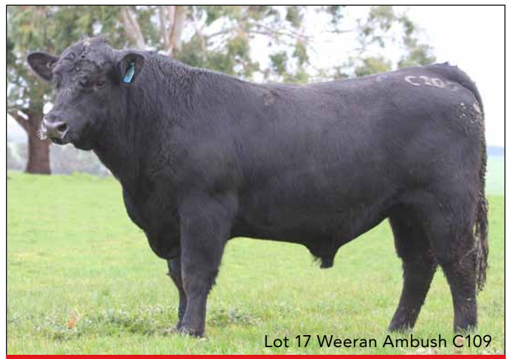
Lot 17 Weeran Ambush C109