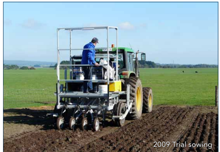
2009 Trial sowing