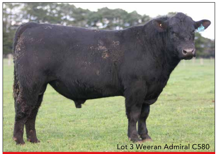
Lot 3 Weeran Admiral C580