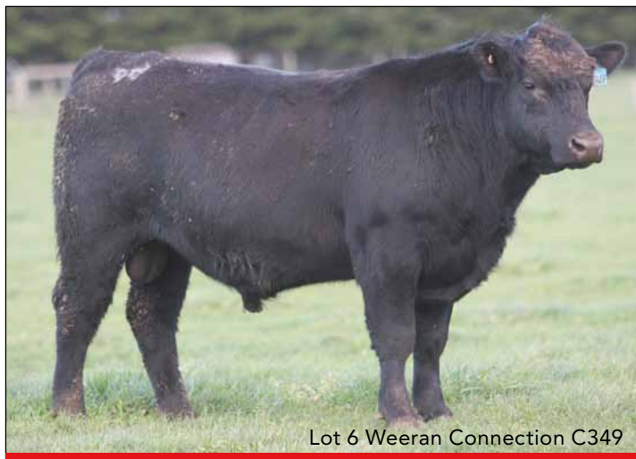
Lot 6 Weeran Connection C349